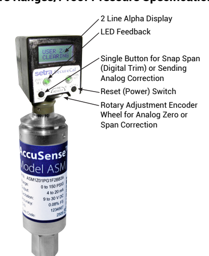
Diagram 2: Pressure Ranges/Proof Pressure Specifications

Span or full scale output adjustments should only be performed by using an accurate pressure standard (electronic calibrator, dead weight tester, digital pressure gauge, etc.) with greater or at least comparable accuracy to the ASM transducer. With full range pressure applied to the high pressure port, the span may be adjusted by pressing the send button to set span. If fine adjustment is needed on span, and control pressure is applied at full pressure range, turn encoder until target correction is achieved on LCD then press send button.